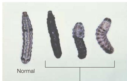
Abnormal molting when chlorfluazuron was treated at 5th instar larvae