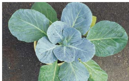
Chlorfluazuron 5%EC/1 L/ha (50 g a.i./ha)