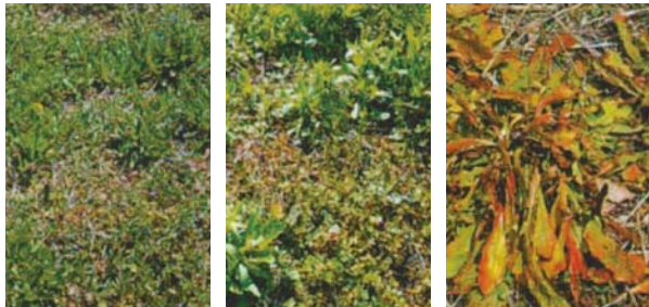
At application 7 days after application 20 days after application