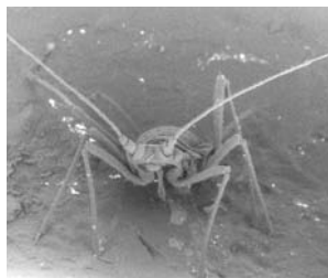
Flonicamid (50 ppm), 3 days after application