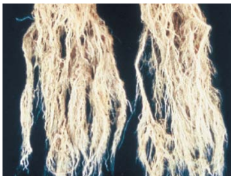
Fosthiazate (2 kg a.i./ha)