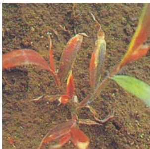
7 days after application