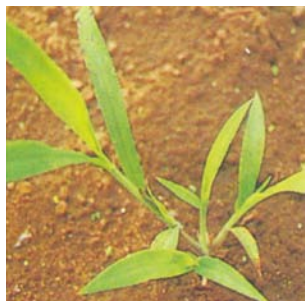
2 days after application