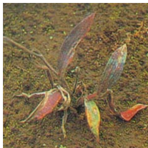
21 days after application Weed: Digitaria ciliaris